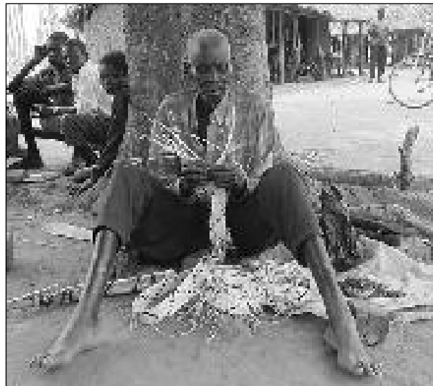
Could this village in Southern Sudan be next in line for micro-enterprise empowerment?

As we celebrate with family and friends this Thanksgiving, we all have much for which we can be thankful. Although I've experienced difficult days in 2008, compared to most in Africa I consider myself and my family extremely blessed.