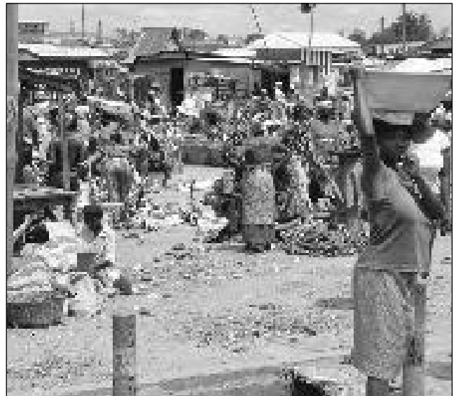
Farmers must often contend with markets like this in Ghana in order to sell their crops

This is especially true for the village of Nsuta, Ghana where agricultural empowerment has now provided a "hand-up" for many in the village. In Nsuta however, a new facet of micro-lending has been created to help loan-client farmers in the village with a major problem they were facing – difficulty in finding a market for their crops.